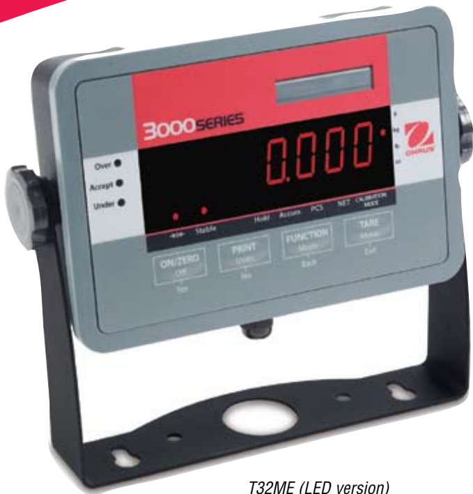
T32ME (LED version)