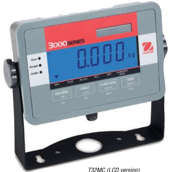
T32MC (LCD version)